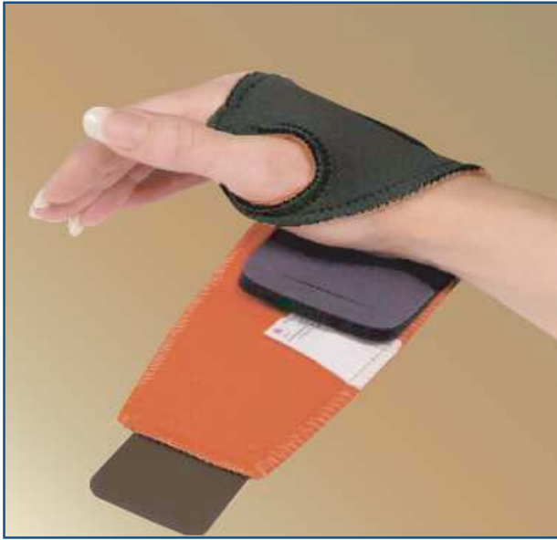
TS226-UREST FOR KEYBOARD USERS