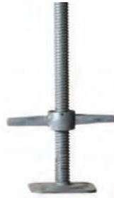
SOLID STEEL SCREW JACK